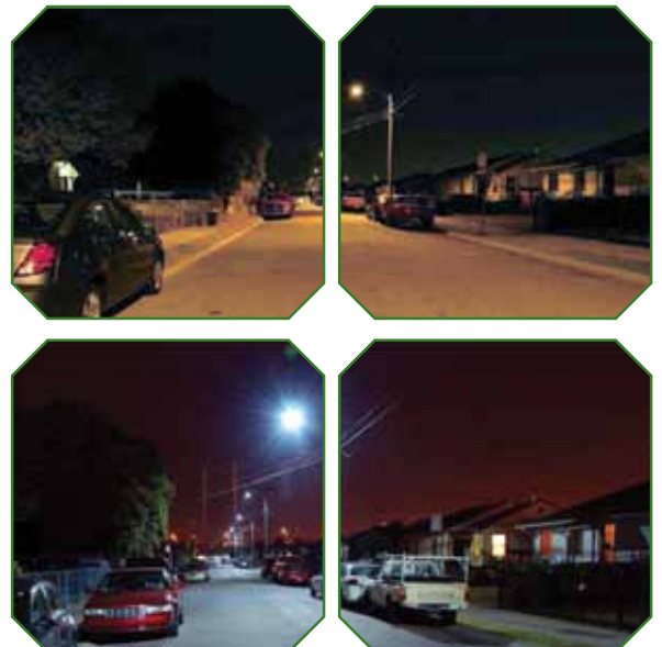
Street lighting using an HPS light source (top) and an LED light source (bottom). The HPS typically has a yellow-orange hue, a shorter life span, and contains mercury.